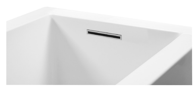
Must be specified when the tub is ordered. Available for select Designer Collection tubs only.

Sleek low profile overflow is factory-installed \, \cdot \, Overflow measures 4.5" x 1" Provides a deeper soak \, \cdot \, Not available for commercial applications