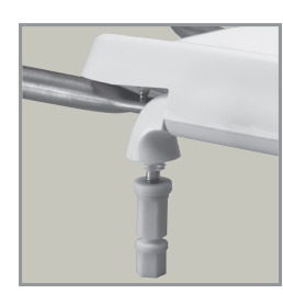
STA-TITE® COMMERCIAL FASTENING SYSTEM™